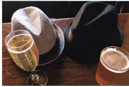
"Bubbles, Beer and New Hats"

Next meeting is Sat. 15 th August at the Goods Shed starting 1.30pm. It would be lovely to have a field trip in September, Sat. 19 th . Let us shake off the winter blues & have a fun day out, perhaps to Tooradin. If you have any ideas please contact me. We can set time/place next meeting.